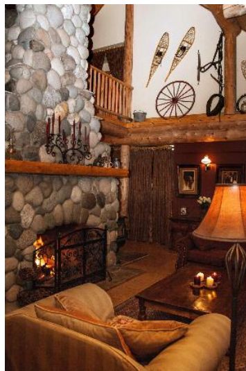
Learning to handle dog teams is one of the ranch's winter activities.